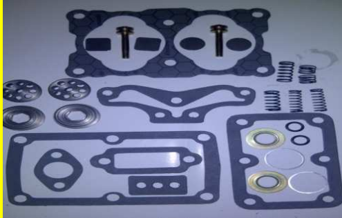
G-570 RPTO.COMPR.TF-550/750 ( R )