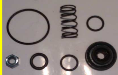
G-281127 RPTO.VALVULA ESTAC.PP-2 (010)(PTPH)