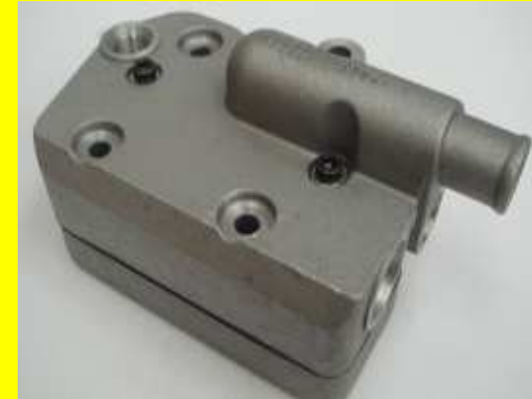
G-117-ISB CABEZA COMP.COMP.WABCO ISB 911 154 650 6