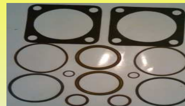
K-3610 RPTO.CONV.RANGOS 4630R3610X F-11 16/18 SPICER