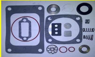
G-BX2150 RPTO.COMPRESOR BX2150 BENDIX (Q)