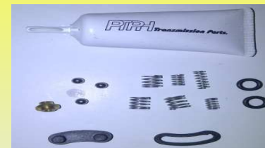
K-1922 RPTO.P/VALV.PATA CABRA 15 VEL.