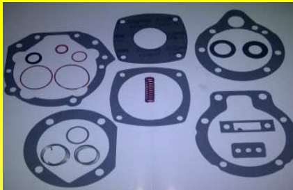
G-72346-U RPTO.COMP.CUMMINS C/JUNTAS (COMESA)