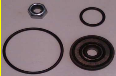
G-281126 RPTO.VALVULA ESTAC.PP-1 (24)(PTPH)