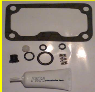
K-1969 RPTO.DE MANGUITO CAJA FULLER