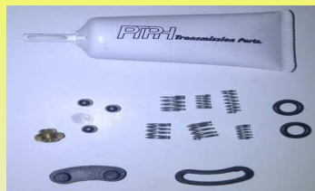
K-1826 RPTO.P/VALV.PATA CABRA 13 VEL.