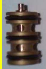
K-19974 RPTO.CAMB.BAJA,PISTON CITO CAJA 13 Y 18 VEL. EATON