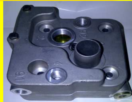
G-117-906 CABEZA COMPLETA WABCO 906 ELECTRONICA