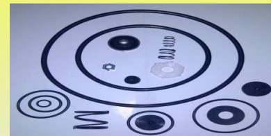
G-AD9 RPTO.SECADOR AD9 MAYOR (PTPH)