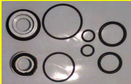
G-11801 RPTO.VALVULA ESTACIONARIO D600(38)