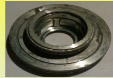
G-4661-2 CANASTILLA SUPERIOR E-7 (16)