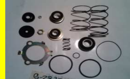
G-287368 RPTO.VALVULA DE PIE E-6 (4)