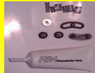
K-2072 RPTO.VALVULA PATA CABRA 18 VEL.