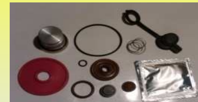
G-BOSCH-OP RPTO.GOBERNADOR BOSCH OP (15)