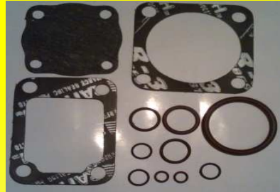
G-312971-X RPTO.CONVERTIDOR SPICER 12/14 VEL F-11