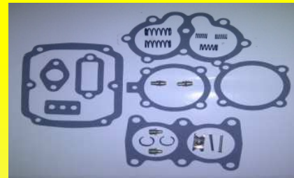
G-229416-U RPT.COMPRESOR TF-400 (COMESA)