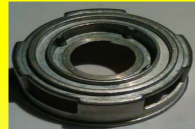
G-244661 CANASTILLA SUPERIOR E-5 (10)