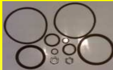
K-205-463-1X RPTO CON.RANGOS PIST F-11 CAJA VEL NVA PSDO/18 SPICER