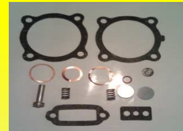
G-850 RPT.CABEZA COMPR MIDLAND 850 (121)