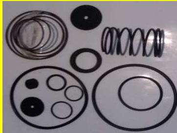
G-RN10HK RPTO.VALVULA RELAY MIDLAND (PTPH)