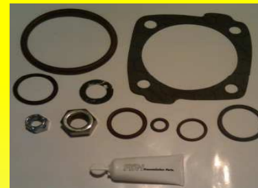
G-1447 RPTO.PIST.O RANGO CAJA FULLER 10 Y 9