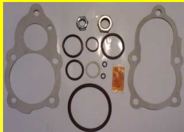
K-2054 RP.MAYOR CONV.RANGOS-PIST CAJA 18 VEL.FULLER NVA