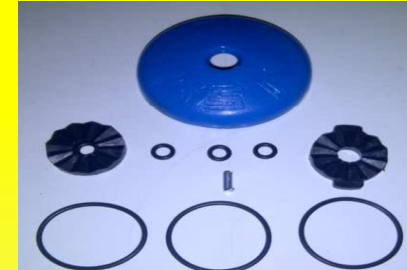
G-313135X-T RPTO.SELECTORA 14/16 VEL C/TAPA SPICER