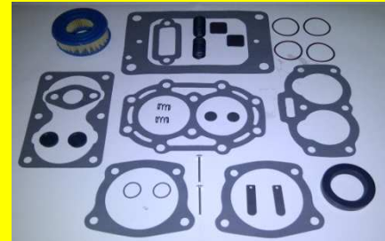
G-RN26DW RPTO.CABEZA COMP.MIDLAND 2" (022)(PTPH)