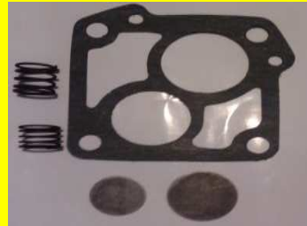
G-CCLY RPTO.CABEZA CLAYTON MC8 (V)