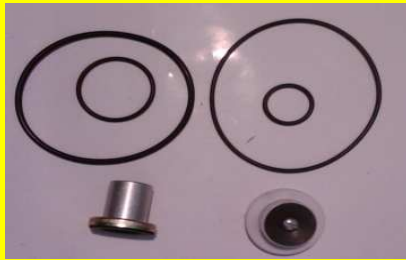
G-102511-C/C RPTO.VALVULA R-12 C/CAMPANA (8)