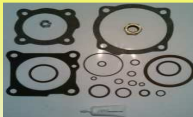
K-3341 RPTO.CAJA # 16918 / 20918 18 VEL. NUEVA