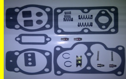
G-287043-U RPTO.COMPRESOR TF-501 (COMESA)