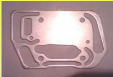
G-J-11 JTA ALUMINIO P/CAB WABCO 9111546506- B (11)