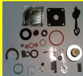
G-WMET RPTO.GOVERNADOR WABCO METALICO (14)