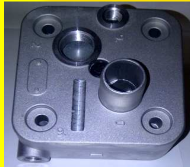
G-117-904 CABEZA COMPLETA P/COMPRESOR WABCO 904