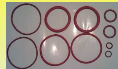
K-3620 RPTO.CONV.RANGOS 4630R3620X F-11 16/18 SPICER