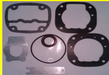
G-159/160 RPTO.P/CABEZA WABCO 159/160 P/M.B (X)