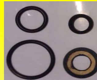
G-7800 RPTO.VALVULA ESCAPE SEALCO (PTPH)