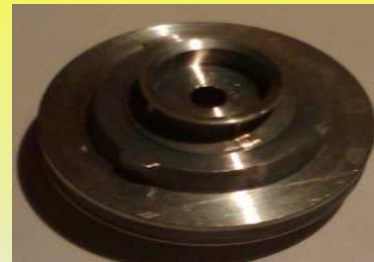
G-4661-1 CANASTILLA CHICA E-7 Y E-6 (18)