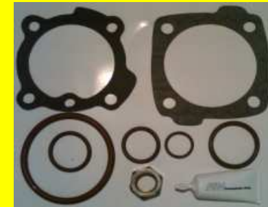
K-2002 RPTO.MENOR CONV.RANGOS-PIST CAJA 18 VEL.FULLER NVA