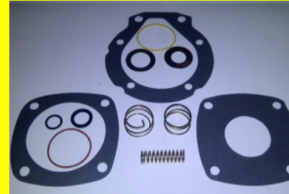
G-72346-C/J RPTO.COMPRESOR CUMMINS C/JUNTAS (PTPH)