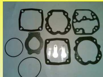
G-KNMB-22 RPTO.CAB.KNORR MMB S-400 DOBLE (22)