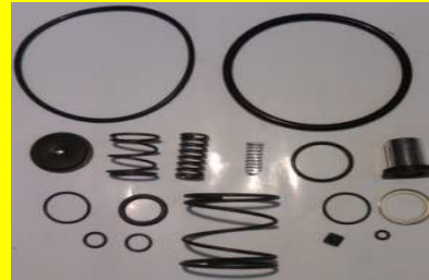
G-RN10HL RPTO.VALVULA MENOR KN30400 (040)(PTPH)