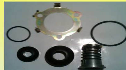
G-276119 RPTO.VALVULA DE PIE E-2 (12)