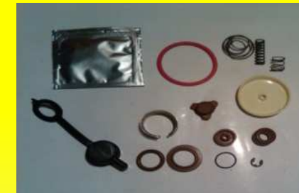
G-GOB-W RPTO.GOBERN WABCO CAPU.PLASTICO (13)