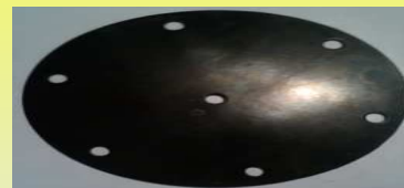
G-A1000 DIAFRAGMA VALVULA TRIPLE SEALCO (32)