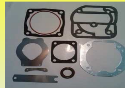
G-LK38 RPTO.CABEZA KNORR 220 LK-38 ENF. X AGUA (L)