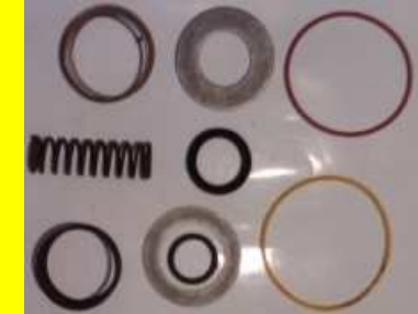
G-7246-S/J RPTO.COMPRESOR CUMMINS S/JUNTAS (PTPH)