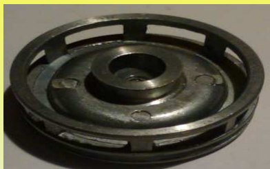
G-244662 CANASTILLA INFERIOR E-5 (19)