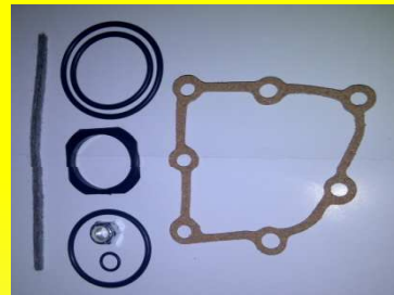
G-DUALM RPTO.DUAL AIRE MENOR (PTPH)