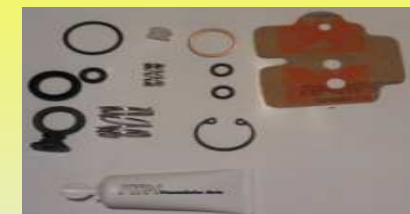
K-1935 RPTO.CAJA (A-5000) 18 VEL. EATON NUEVO