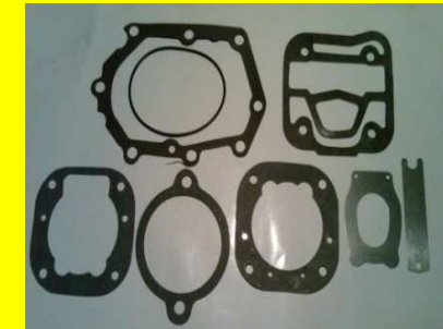
G-CCLY-2 RPTO.CABEZA CLAYTON (Y)