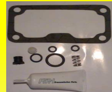
G-1699 RP.CONV.LATER AL CAJA FULLER 9,10 Y 13 COMUN