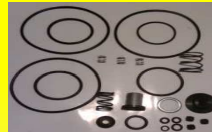
G-FF2 RPTO.VALVULA FULL RELAY (PTPH)