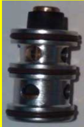
K-4300810 RPTO.CAMB.ALTAS-BAJAS P/VEL.CAJA FULLER NVA.