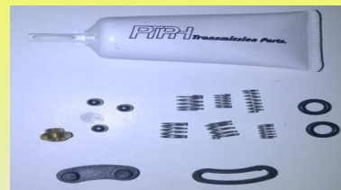
K-1921 RPTO.P/VALV.PATA CABRA 9 Y 10 VEL.EATON