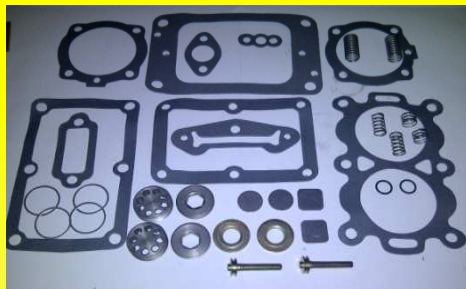
G-RNT26-1 RPTO.CAB.COMP.MIDLAND 2 3/4 VALV. 5/8 (O)