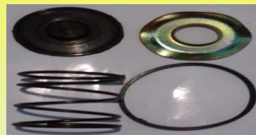
G-275875 RPTO.P/VALV.205000 (027)(PTPH)