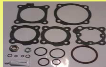
K-3510 RPTO CAJA SUPER SHIFT SEMI ELECTR.FULLER