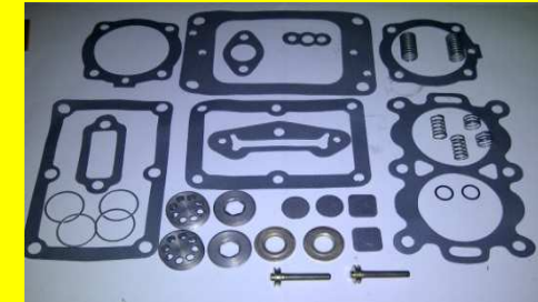
G-RNT26 RPTO.CAB.COMP.MIDLAND 2 3/4 VALV. 1/2 (Ñ)