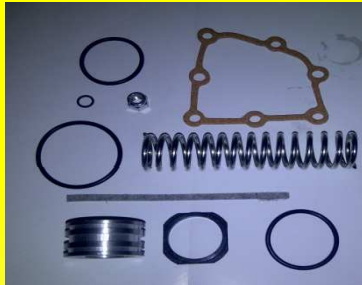
G-DUAL RPTO.DUAL DE AIRE COMPLETO (PTPH)