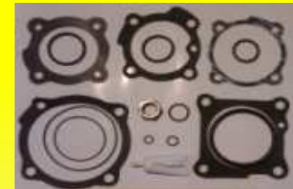
K-2298 RPTO CAJA FULLER NVA