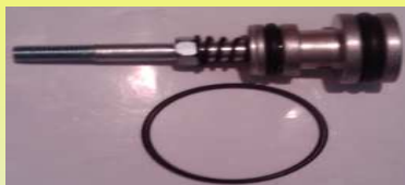
G-99600 RPTO.VALV. ESTACIONARIO D-500 (39)