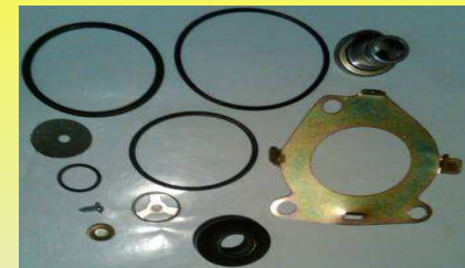
G-281084 RPTO.VALVULA DE PIE E-5 (5)