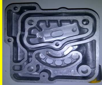
G-72 TAPA CABEZA COMPR. INF ISX WABCO 9111534546