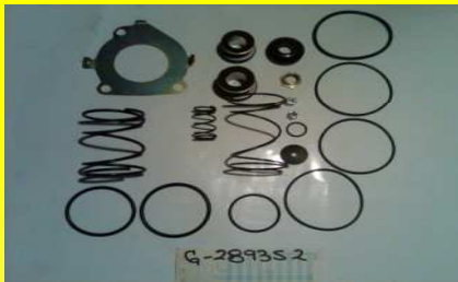
G-289352 RPTO.VALVULA DE PIE E-7 (3)